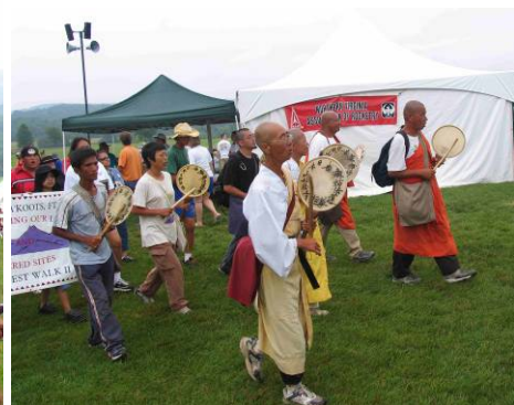
July 4 at Great Meadows with Longest Walk II participants.

July 9 – The American Indian Inaugural Ball (AIIB) Committee met at the Hyatt Regency in Crystal City. Before the meeting, the group toured the hotel. The