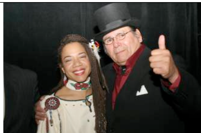
Martha Redbone and Dennis Banks